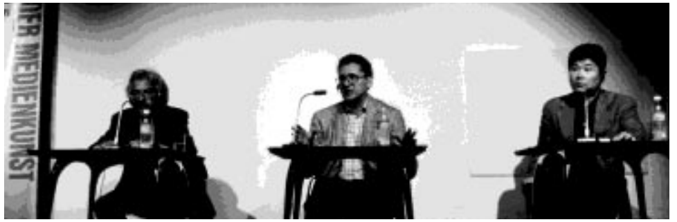
Japan-Germany Media Art Symposium