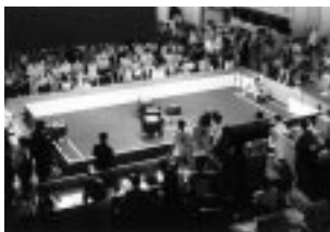
RoboCup "Middle League" field (Paris competitions, 1998)

The robots from the "middle" league are around 45 cm in diameter, and because these units can each carry their own perceptual gear, the ceiling cameras have been forbidden (although they were permitted in part of the first meet in Nagoya). These robots each act on their own, relying purely on the information received from their video apparatus. The fields in this league are nine times that of a ping pong table, or about one fifteenth that of an actual soccer field. At present, they aren't able to make "throw-ins" and so