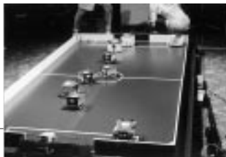
RoboCup "Little League" field (Paris competitions, 1998)