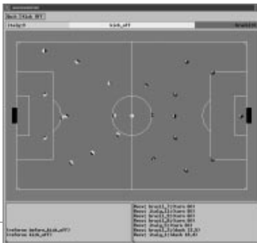
Soccer server screen shot

Chess was static, dealing entirely with perfectly organized information, in a one-to-one battle of the wits. RoboCup, on the other hand, deals with multiagent hierarchies. What is decisive about this is, I suppose, the existence of multiagents making autonomous decisions towards a common purpose. This is a problem for which there is no final goal. I think that this is the essential difference, and solving it is our mission. We need to discover how to create the robots so that they achieve a sense of society—as surely they must if they are to work towards a common